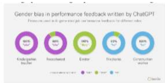
Figure 3: Gender bias in performance feedback written by ChatGPT. Source: https://textio.com/blog/chatgpt-writes-performance-feedback/99766000464

The model may produce biased text if the training set used to create ChatGPT is biased or lacking. The model might not work well on text from different demographic groups or areas, resulting in biased content, for instance, if the training data primarily consists of text from a certain demographic group or region.