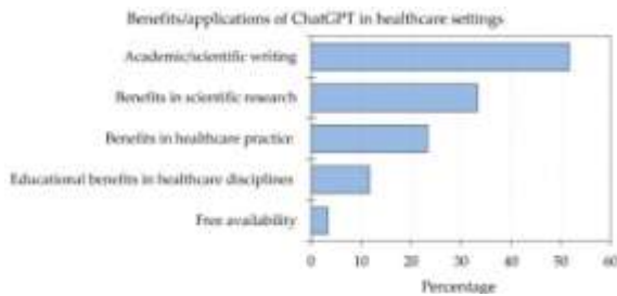
Figure 2: Summary of benefits/applications of ChatGPT in health care education.

guidance, making mental health interventions more available and practical.